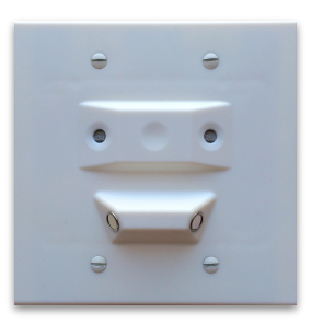
Guardian is the Security Industry's #1 Choice for Enterprise Deployments

Guardian has successfully passed multiple and rigorous customer test protocols, including information security and penetration testing performed by Fortune 10-500 global enterprises.